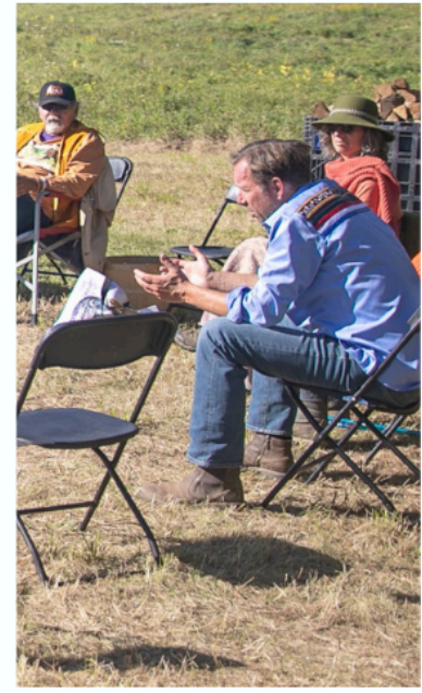
King Land Opening, October 2024